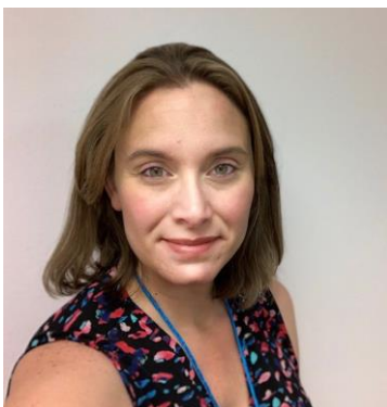
Sex Offender Therapy Instructor