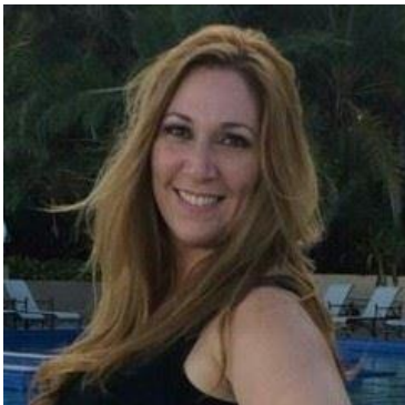
IICS Dean of Students IICS Advisory Board