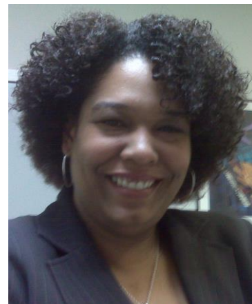
IICS Compliance Officer IICS Advisory Board