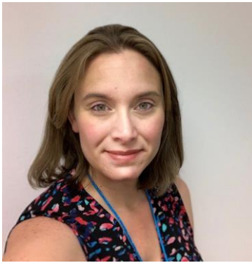
Sex Offender Therapy Instructor