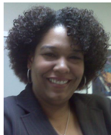
IICS Compliance Officer IICS Advisory Board