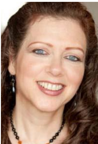
Kink Conscious Therapy Instructor