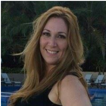
IICS Dean of Students IICS Advisory Board