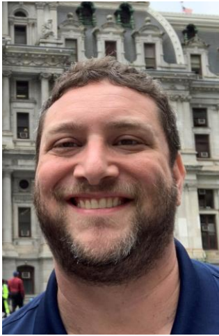
IRB Chair IICS Advisory Board